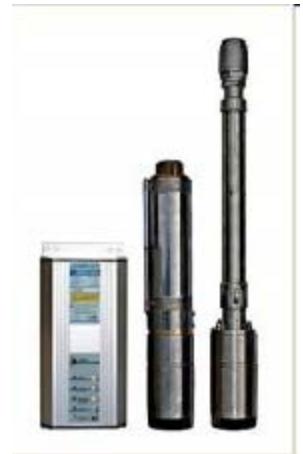
LORENTZ PS left: Centric (C) right: Helical Rotor (HR)