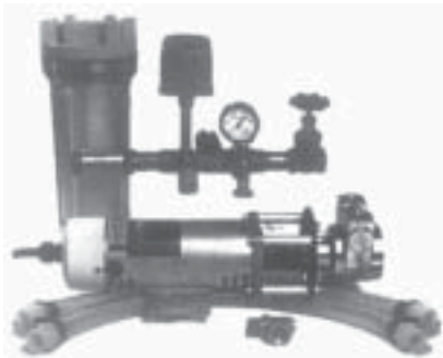
Flowlight™ Booster Pump, with optional E-Z Installation Kit and 5 Micron Filter & Housing

The Standard Booster Pump model has the highest flow and should be used where suction lift is less than 10 feet. The Low flow model has a higher pressure capacity and should be used where suction lift is greater than 10 feet or where suction pipe is less than 1" inside diameter. Maximum suction lift is 20 feet at sea level.